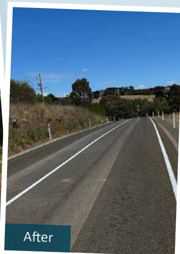
Cape Clear-Rokewood Road widening in Rokewood. (shown above)