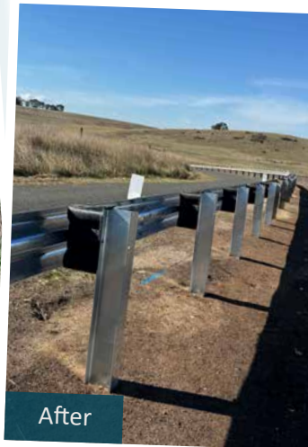
Bassetts Road, Mannibadar, road and drain repair. (shown above)